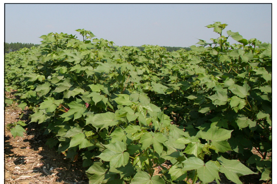
Sample depth for cropland is 6-8 inches