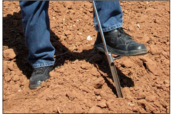
Soil sampling—Take 15-20 cores for one sample. Don't Guess—Soil Test.