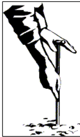
Soil Sampling Tube