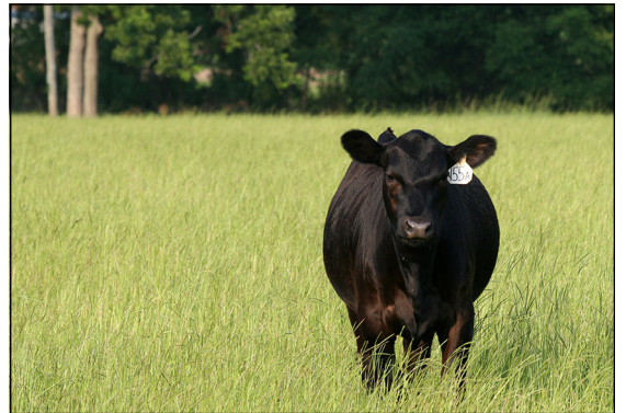
Sample depth for pastures is 4 inches